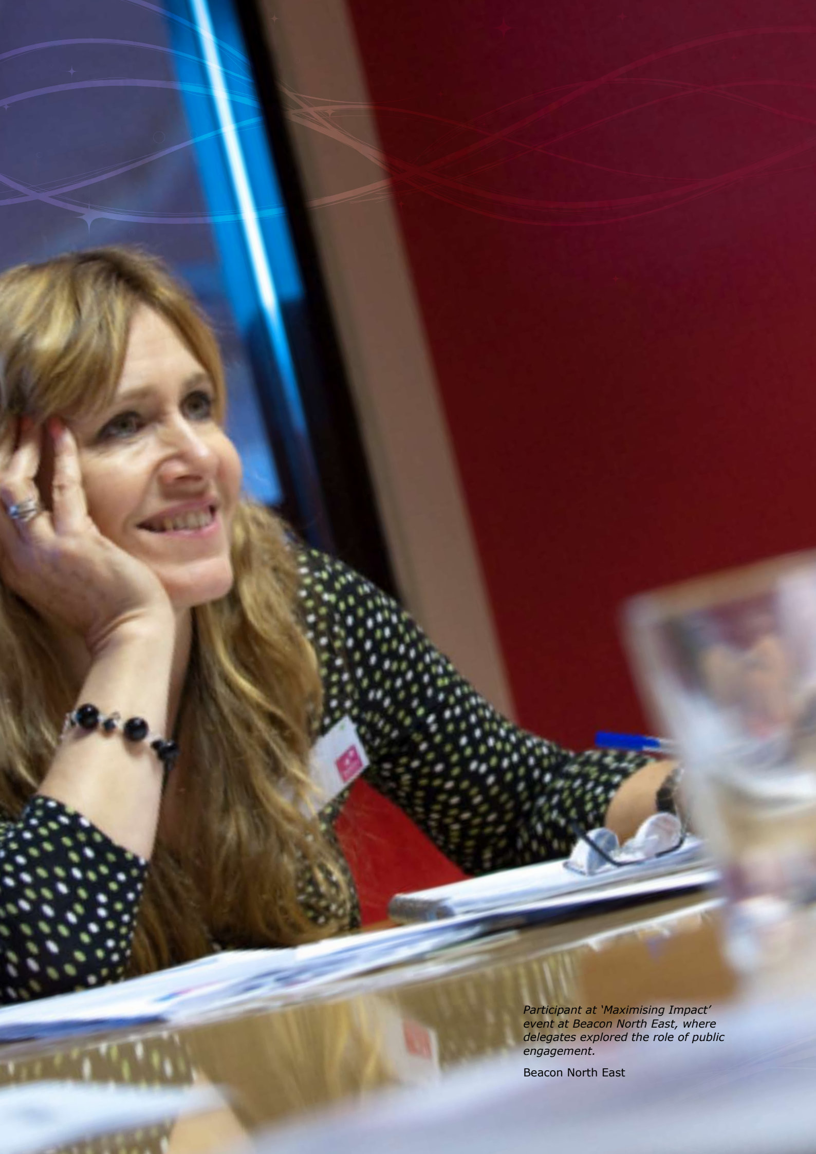
Participant at 'Maximising Impact' event at Beacon North East, where delegates explored the role of public engagement.